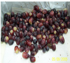
Not Attached (Shattered)