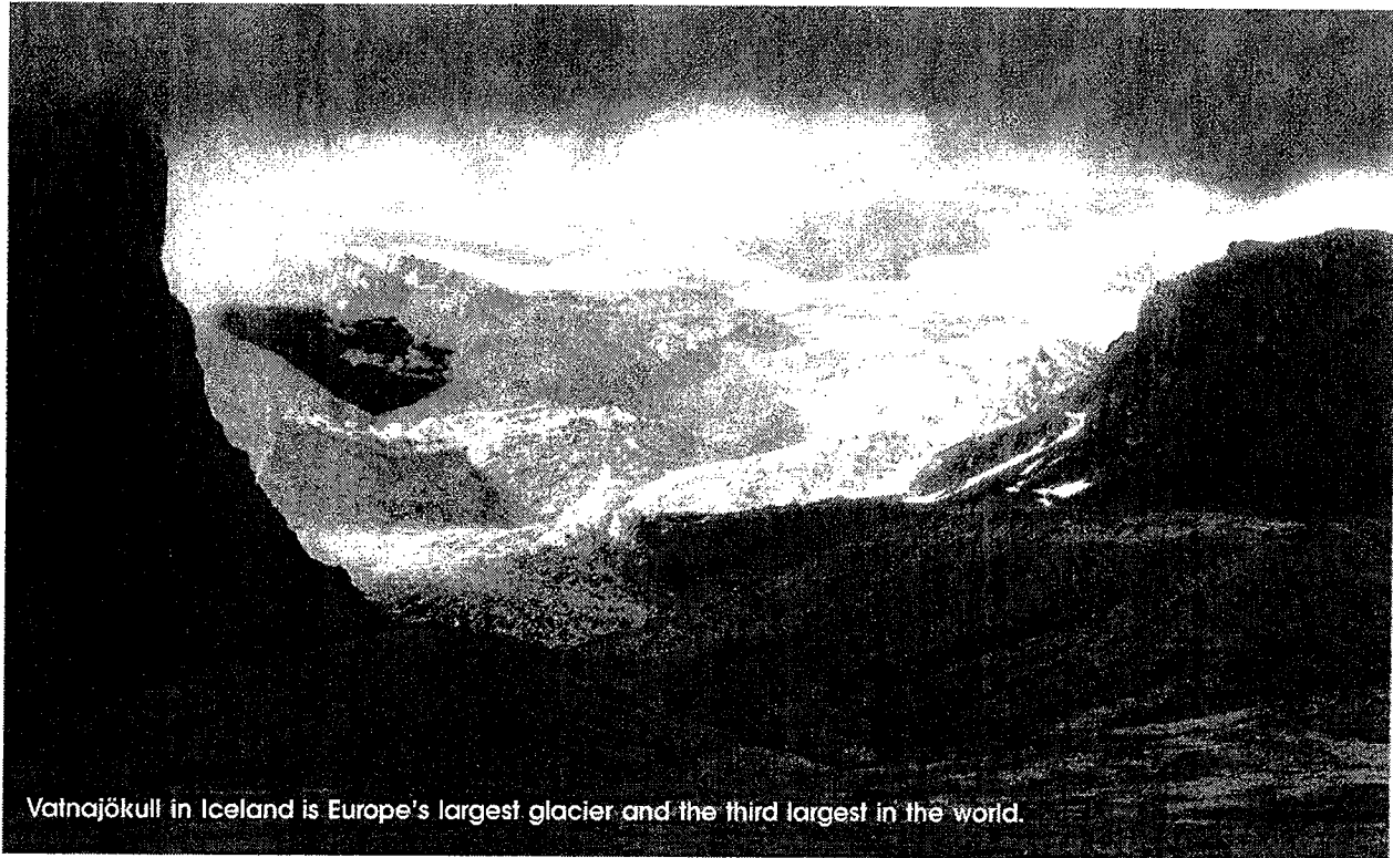
Vatnajökull in Iceland is Europe's largest glacier and the third largest in the world.

smoke, ash, and steam flying 4–5 kilometers high. Although the eruption ended on October 19, observers knew there was more to come as water continued to melt and flow. The depression in the ice continued to expand to about 9 kilometers long and 3–4 kilometers wide, and the level of the lake continued to rise. By late October, scientists warned that the water level at Grimsvötn was almost high enough to breach the ice barrier that held the lake in place. The road around southeastern Iceland was closed. This flood was going to be a BIG one!