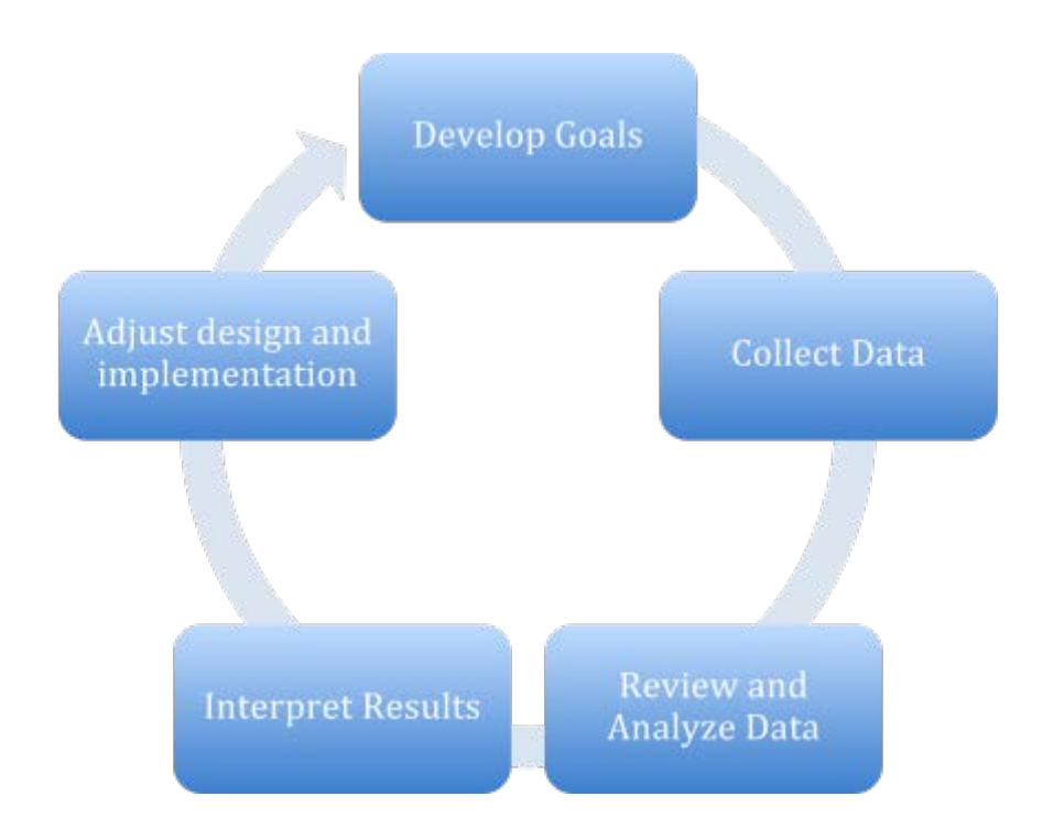
Diagram 5 : Evaluation Process.

During evaluation, stakeholders will use collected data to identify program strengths and areas for improvement toward achieving portfolio and capstone goals. The evaluation process (see Diagram 5 below) will also identify implications for systems, instruction, and resources/tools. By implementintg a robust evaluation process, districts and schools should see an increase in program effectiveness, bringing the portfolio and/or capstone project closer to the school or district's desired vision.