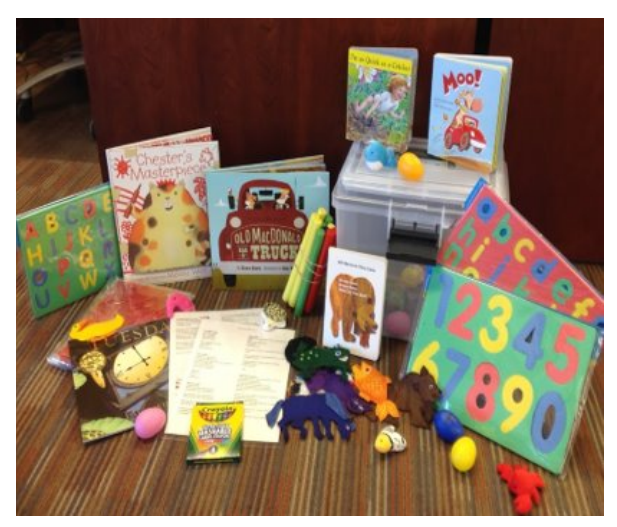
Literacy kits included a variety of books, manipulatives to increase motor skills, puzzles to develop number and letter recognition, shakers to connect with a music theme, and finger puppets to develop vocabulary, and a song list.

Each week the librarian from Ignacio Community Library District focused on one of the five early literacy practices and FFNs receive a plastic box to store all the materials. Librarians recognized their important role as early literacy teachers for FFNs as they modeled reading techniques during Story Times with young children and demonstrated activities that can enhance or build upon early literacy interactions. The information and tools provided to FFNs increased their level of comfort in using the resources at the library and at home in their role as teachers of the children in their care. "One mom took our GRT class (Five Best Practices of Early Literacy). At first, she was hesitant about the books and why we chose them. Now she's excited and tries reading at home. She's more confident with literacy and reading with kids." (Ignacio). As one librarian noted, "What could be better than sharing the love of reading?"