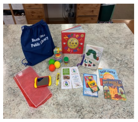
Literacy kits included a bag to store the materials, crayons, handwriting book, sorting cups of different colors and sizes, and a variety of books.

Librarians put a lot of thought into the preparation of early literacy bags or kits, and many assembled kits according to themes or adjusted for the child's age, either to be given away to FFNs or to be part of the permanent library collection. Librarians reported the flexibility of the grant was one of the parts they liked the most about GRT because it allowed them to decide whether to purchase, books, computers, or enhancing the environment based on the needs of their libraries. "We are the hot spot for little kids. We used the grant money to buy board books and leveled books. I ordered 2 shelves for the kids' room, the grant partly paid for them and our library covered the rest. It was great." (Northern Chaffee County- Buena Vista).